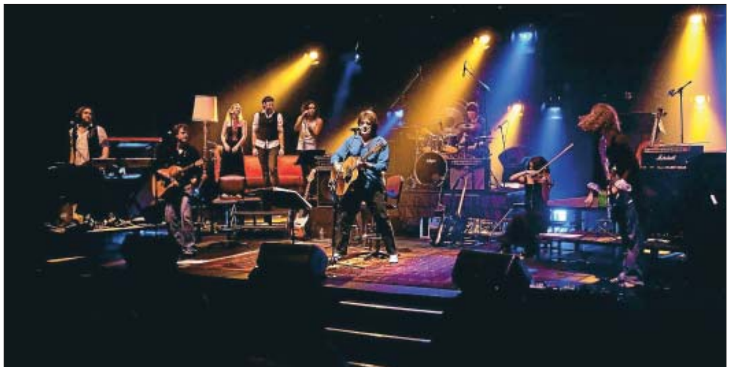
STILL ROCKIN': Living legend Jon English proves he still has what it takes as he belts it out with the talented young musicians in The Rock Show .