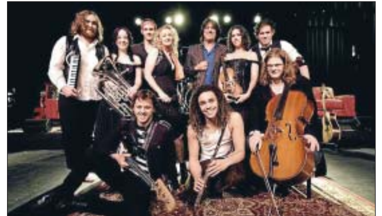
ROCK ON: The cast of The Rock Show is blazing their way across the countryside breathing life into some of rock's most recognised chart toppers from artists such as The Beatles and The Rolling Stones.

"I was introduced to versatility doing a rock show ( Jesus